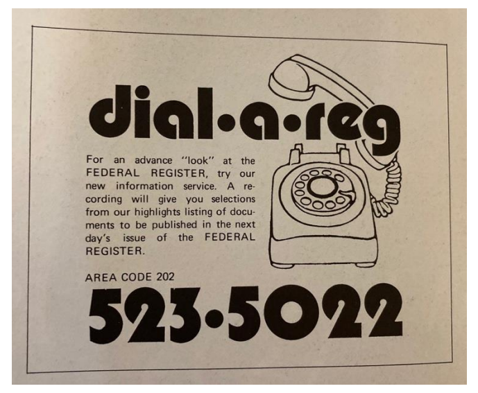
Source: U.S. Office of the Federal Register, "The Federal Register: What it is and how to use it" (1977).

that procedures for providing notice may be held unconstitutional under Mullane if they are not