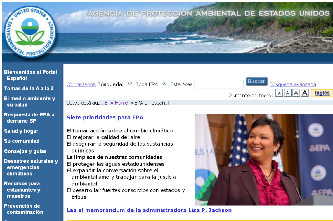
Figure 11: U.S. Environmental Protection Agency's Spanish Version of its Website