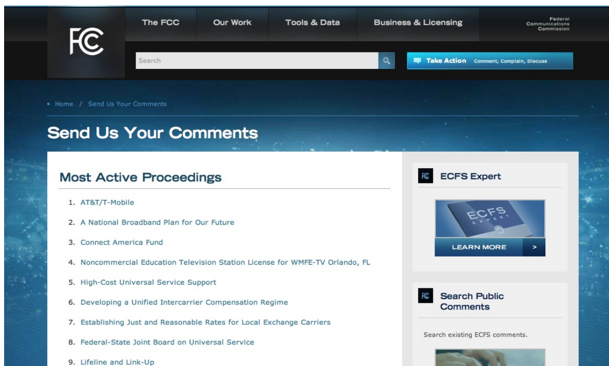
Figure 7: Federal Communications Commission’s Listing of Most Active Proceedings