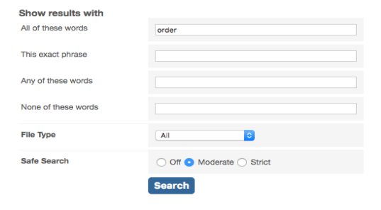
Figure 1. Example of Advanced Search Options on FMSHRC's Website<sup>98</sup>

Search engines are therefore useful for finding adjudicatory materials generally, as well as for locating specific materials provided a user enters search terms particular to an identifiable record. If a website has an advanced search engine, the odds of finding a particular record or type of record are generally greater.