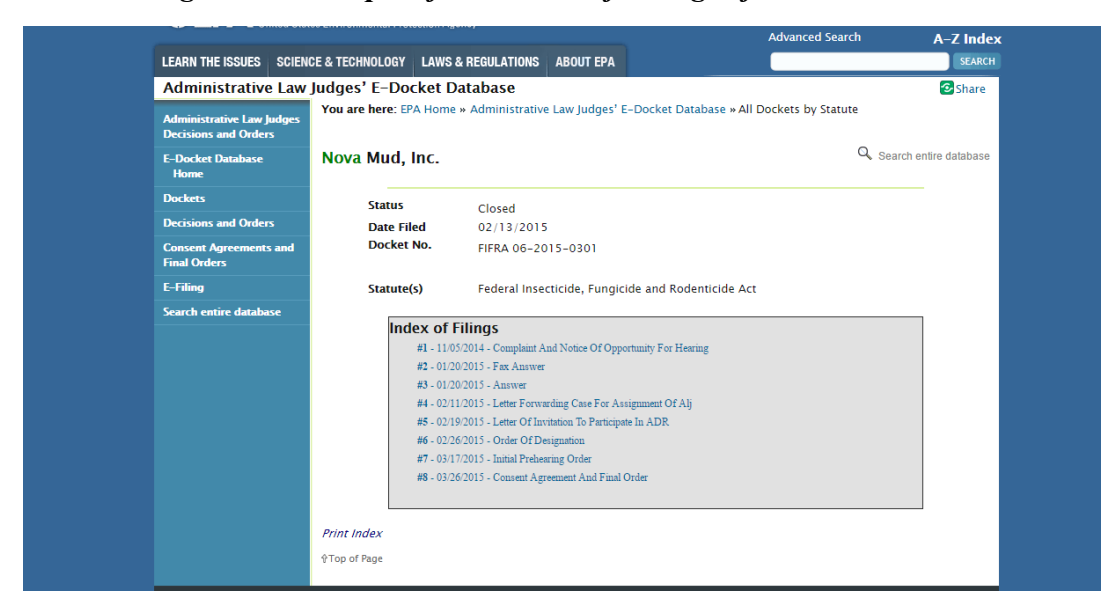
Figure 5. Example of an "Index of Filings" from EPA's Website<sup>118</sup>

While significantly smaller than EPA, FMC maintained an equally comprehensive adjudicatory section on its website. Like EPA's, FMC's website contained a wide array of orders and opinions, including initial and procedural orders and Commission final decisions. Also like EPA's, FMC's website posted a large number of supporting materials, including various types of pleadings and motions. Clicking on the "Documents & Proceedings" link on the homepage's banner led to a page containing links to several adjudicatory sections, including a section entitled "Activity Logs." That section maintained a listing of all documents issued or filed in proceedings before the Commission (dating as far back as the 1980s in a few instances). By navigating to the "Docket Logs" page and clicking on a case name, a user could view the decisions and supporting adjudicatory materials issued or filed in that case. By navigating to the Complaint of the Complaint of the Gederal court docket sheets available on PACER. Several records, including the complaint, a motion to dismiss and response thereto, the initial decision, a motion to enlarge the time for filing exceptions to the initial decision, and the order approving the settlement agreement and dismissing the proceeding, were all available in PDF format. Additionally, docket