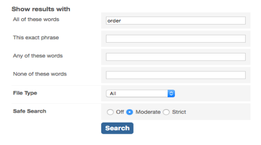
Figure 1. Example of Advanced Search Options on FMSHRC's Website<sup>98</sup>

Search engines are therefore useful for finding adjudicatory materials generally, as well as for locating specific materials provided a user enters search terms particular to an identifiable record. If a website has an advanced search engine, the odds of finding a particular record or type of record are generally greater.