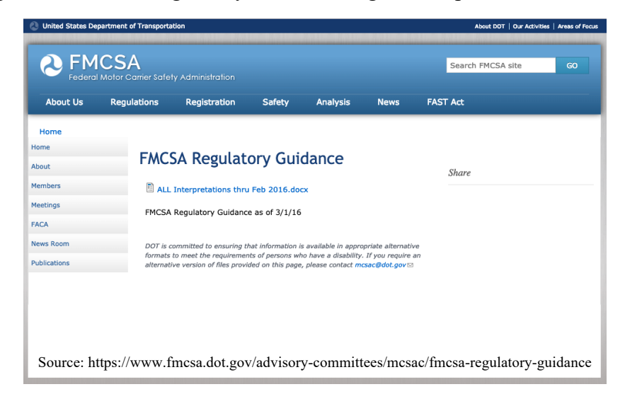
Figure 1: FMSCA Regulatory Guidance Page Last Updated March 1, 2016

management procedures that will make it more automatic for guidance to be disseminated in a timely fashion.