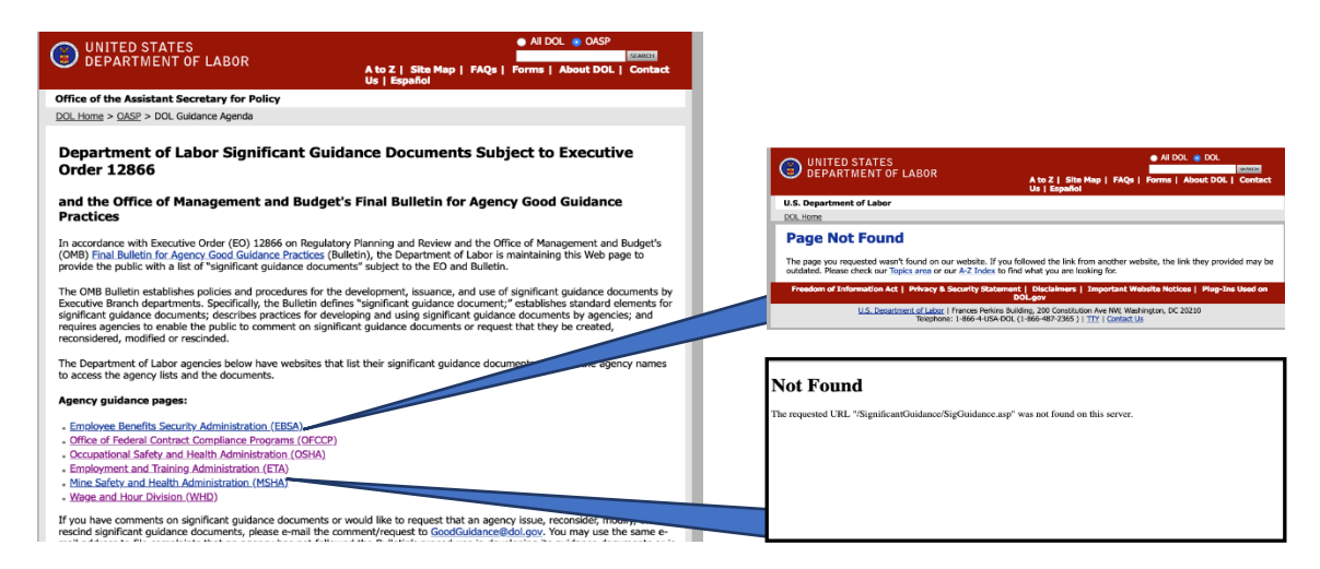
Figure 2: Broken Links as Barriers to Access

Even when links are not broken, websites may still prove hard to navigate and users may be unable to locate the dedicated guidance webpages called for in the OMB Bulletin. For example, GAO auditors reported, somewhat mysteriously, that, while they initially were able to find "HHS's page for significant guidance through a search of the agency's website," later they were "unable to locate HHS's significant guidance page."<sup>186</sup>