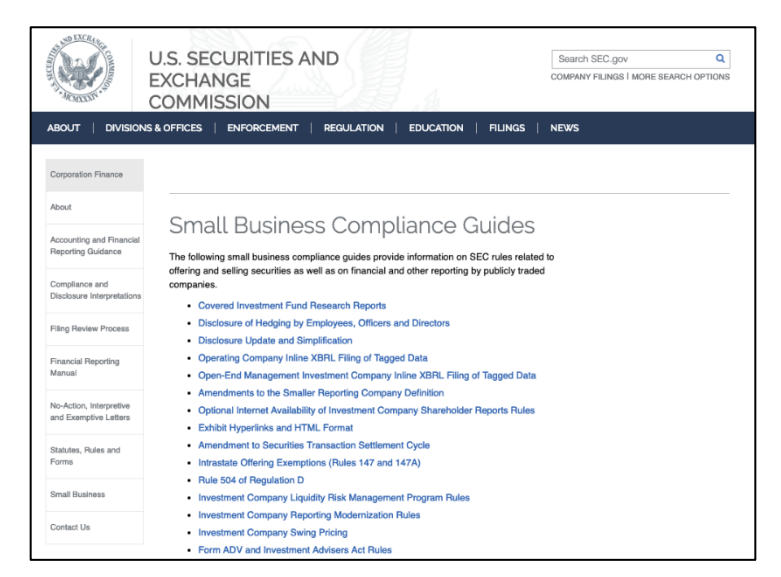
Figure 7: SEC Small Business Compliance Guide Webpage