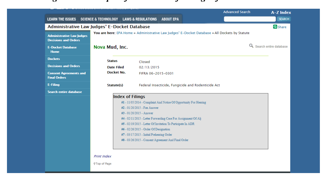
Figure 5. Example of an "Index of Filings" from EPA's Website<sup>118</sup>

While significantly smaller than EPA, FMC maintained an equally comprehensive adjudicatory section on its website. Like EPA's, FMC's website contained a wide array of orders and opinions, including initial and procedural orders and Commission final decisions. Also like EPA's, FMC's website posted a large number of supporting materials, including various types of pleadings and motions. Clicking on the "Documents & Proceedings" link on the homepage's banner led to a page containing links to several adjudicatory sections, including a section entitled "Activity Logs." That section maintained a listing of all documents issued or filed in proceedings before the Commission (dating as far back as the 1980s in a few instances). By navigating to the "Docket Logs" page and clicking on a case name, a user could view the decisions and supporting adjudicatory materials issued or filed in that case. By navigating to the Complaint of the Complaint of the Gederal court docket sheets available on PACER. Several records, including the complaint, a motion to dismiss and response thereto, the initial decision, a motion to enlarge the time for filing exceptions to the initial decision, and the order approving the settlement agreement and dismissing the proceeding, were all available in PDF format. Additionally, docket